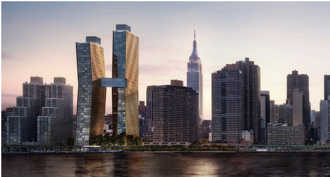
Exterior rendering of the SHoP-designed towers with the skybridge spanning the 27th to 29th floors.