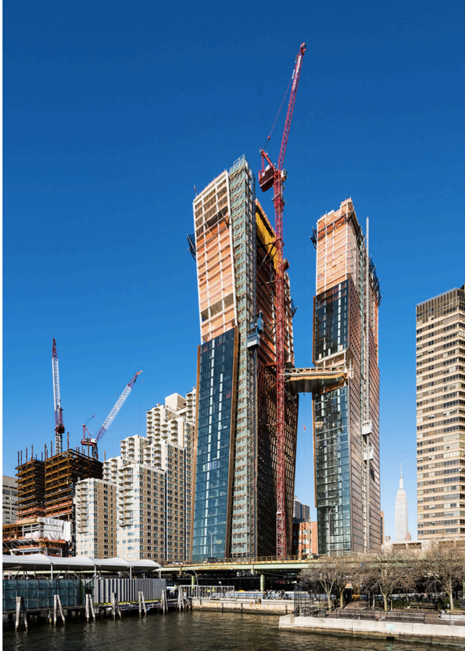
JDS Developers hope to have the towers completed in 2017.