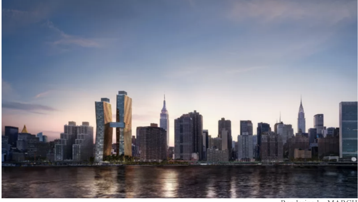
Rendering by MARCH

The building's skybridge will hold a plethora of over-the-top amenities BY <u>AMY PLITT</u> <u>@PLITTER</u> APR 20, 2016, 12:33P