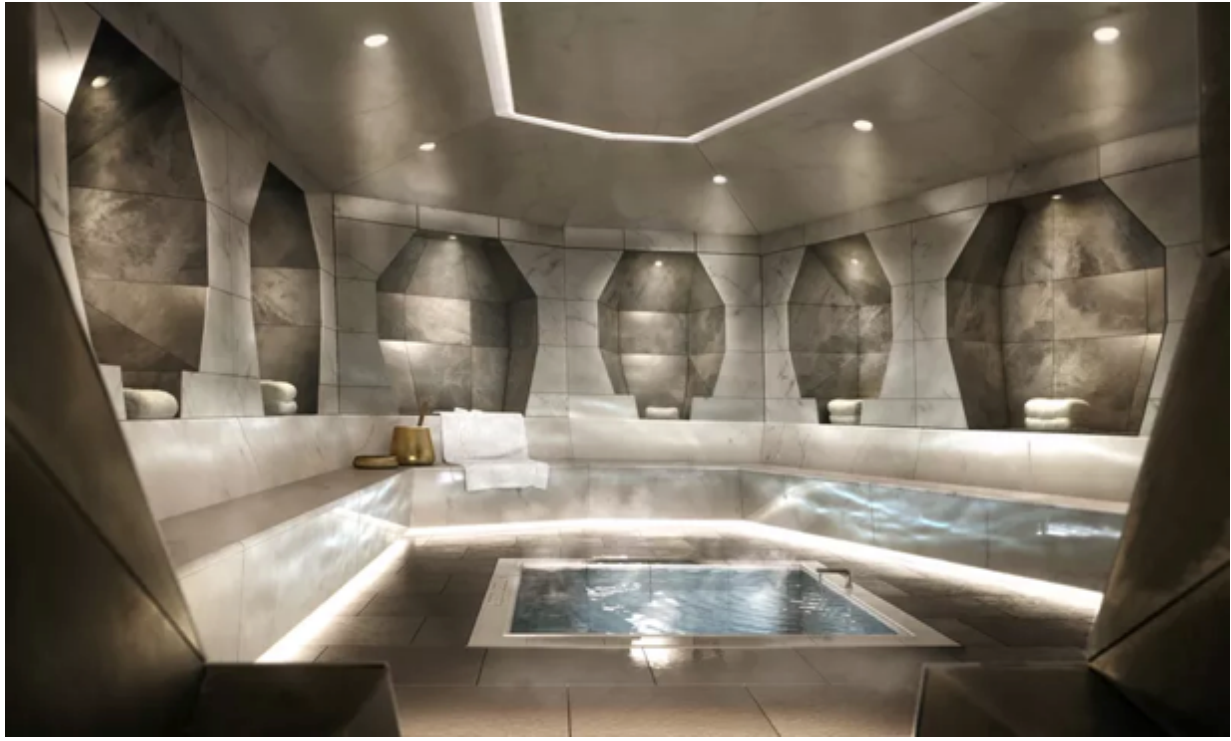
The hammam and its plunge pool