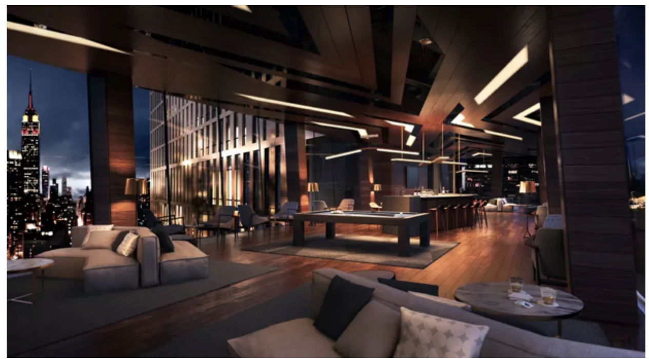
The residents' lounge in the skybridge.