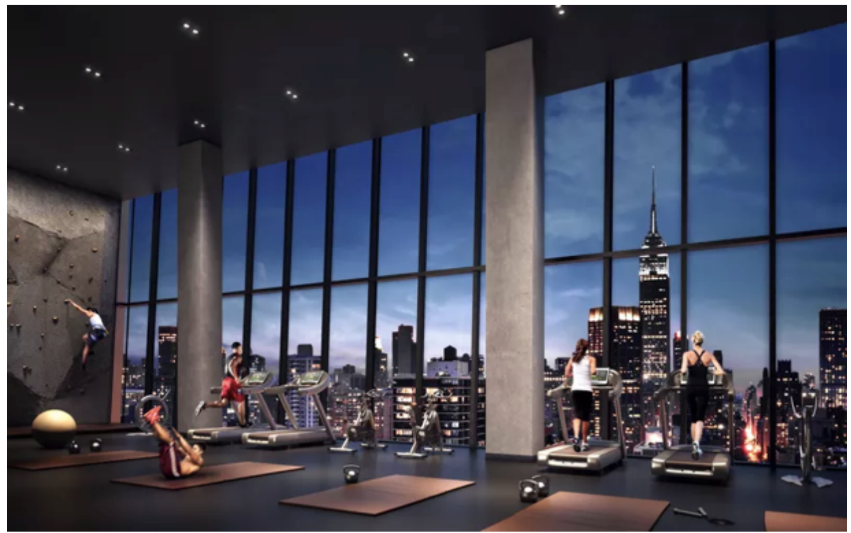
The fitness center has double-height ceilings, a climbing wall, and pretty spectacular views

The building's 761 units will be rentals, though no pricing information has been revealed for those as of yet; a teaser site is <u>now live</u>, though, for those who are curious. Construction began on the twisty towers in 2015, replacing an old mud pit that had been an eyesore on the East side for some time; when the project was initially announced,