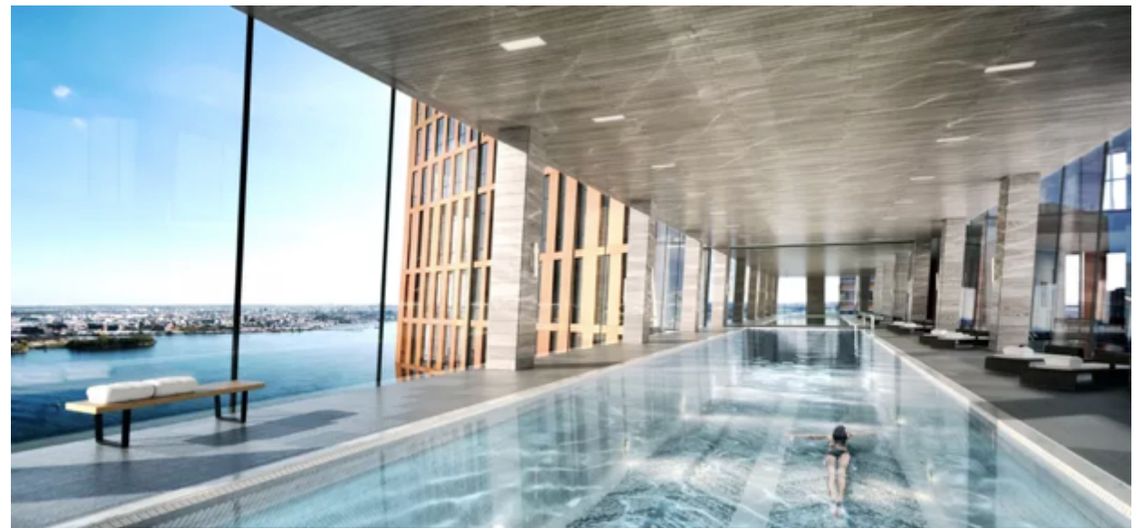
The pool in the skybridge