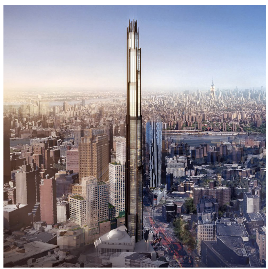
Brooklyn's first supertall tower recently received the green light for construction.