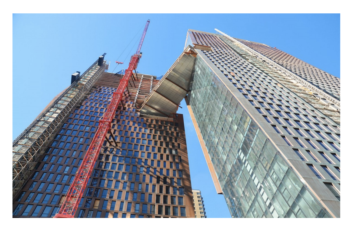
The project is far from SHoP and JDS Development's first: The duo's other joint ventures include the world's slimmest tower—now underway at the foot of Central Park—and Brooklyn's first supertall skyscraper, soon slated to break ground.