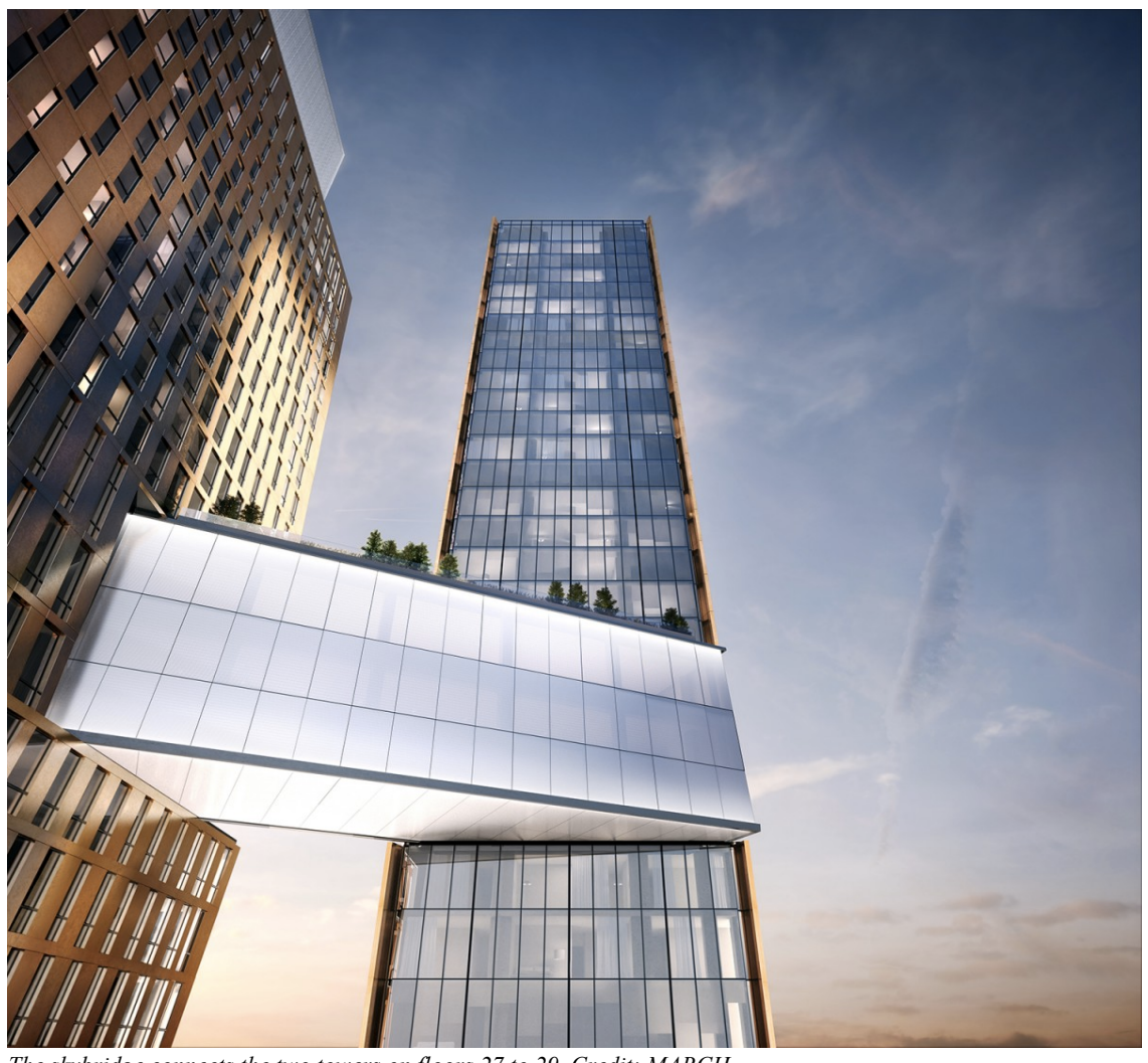
The skybridge connects the two towers on floors 27 to 29. Credit: MARCH

Aptly named the American Copper Buildings, the new construction—located at 626 First Avenue at 36th Street—will house a total of 761 residences ranging from studios to one-bedroom apartments (150 of which will be classified as affordable housing), all offering sweeping views of the Manhattan skyline and East River. While the taller of the two will reach 48 stories, the shorter will top off at 41 floors.