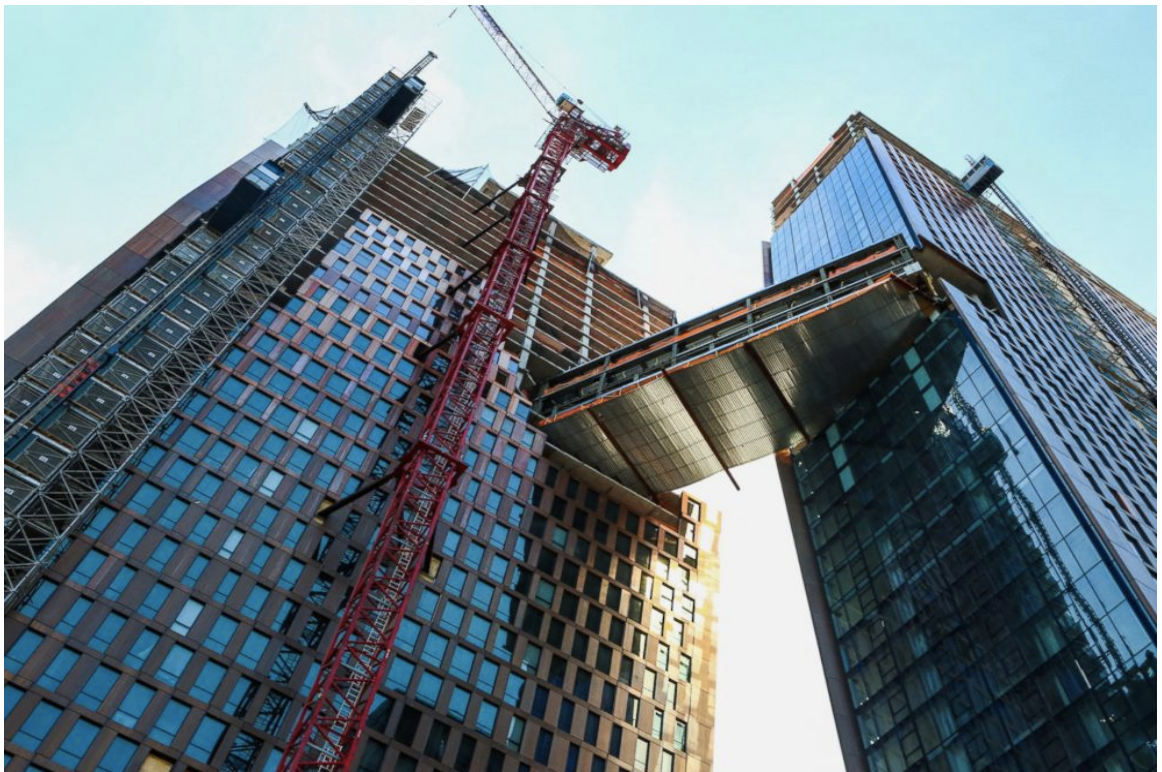
The American Copper Buildings with skybridge stands under construction in New York, April 19, 2016.

If the skybridge pool isn't enough, there will be an infinity pool, outdoor shower, dining and grilling on the rooftop. The development will also have a fitness center with climbing wall.