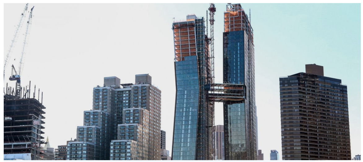
The American Copper Buildings with skybridge stands under construction in New York, April 19, 2016.

By next year, the wealthiest New Yorkers will be able to swim 300-feet in the air in a swimming pool suspended between two towers.