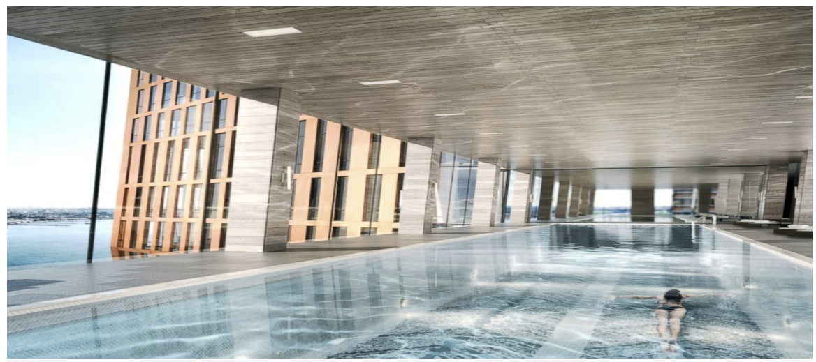
A rendering of the American Copper Buildings shows the view from inside the skybridge that will link the two towers of the development.

Some of the wealthiest New Yorkers are expected to live in the 761 residences, though 150 apartments of those are set aside as affordable housing. Prices haven't been announced yet. The residences range in size from studios to three bedrooms, the developers said. Over 5,000 copper panels make up the facade.