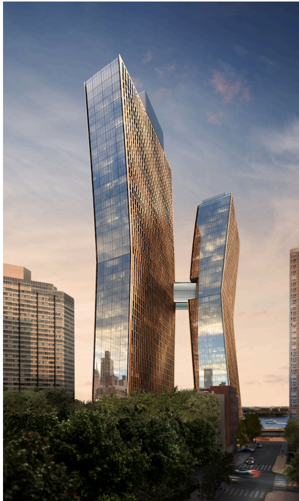
Exterior rendering of the American Copper Buildings JDS

The asymmetrical towers are closest together at the 30th floor. Instead of creating two smaller amenities areas, the architects decided to connect the buildings with a skybridge to help create community in the building and give all residents access to a bigger space that also includes private terraces, a bar and restaurant, a full fitness center with a climbing wall and a hot tub.