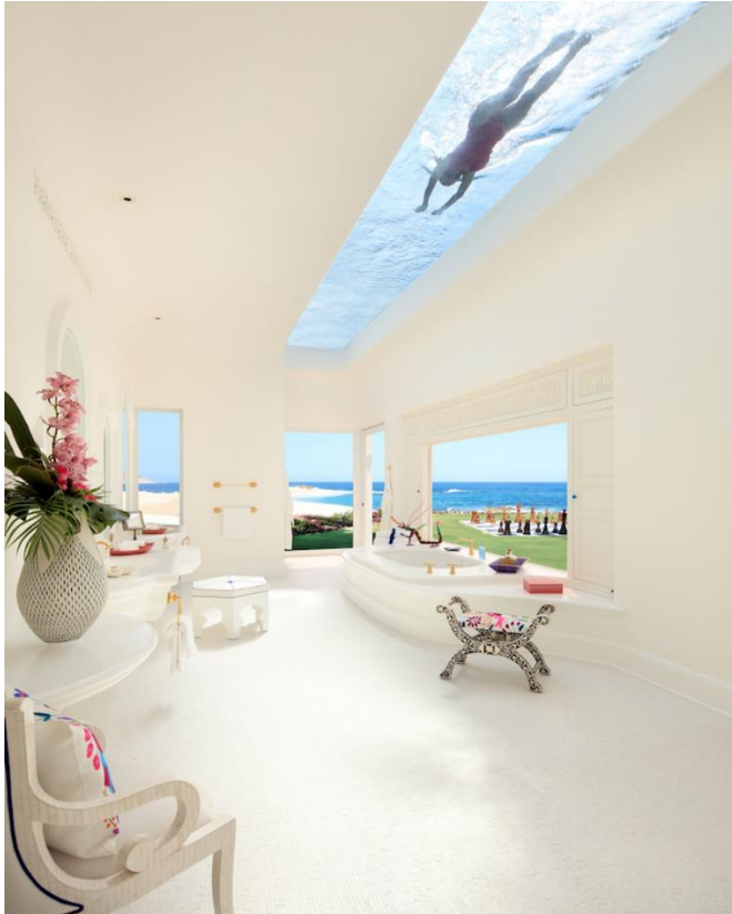
Ty Warner Mansion at Las Ventanas al Paraiso

This Rosewood Resort über oasis could dominate any Instagram theme all by itself. If it's wrap-around moat pool doesn't pique your curiosity, maybe its garden walls, sky-high vaulted ceilings, Mayan statues, sky roof pool will. How could it not?