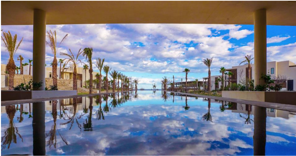
Reflective infinity pool

This new beachfront Auberge-operated luxury hotel has an oceanfront hot tub, fire pits, and a reflective three-tiered infinite swimming pool that spills into the horizon like a mirage.