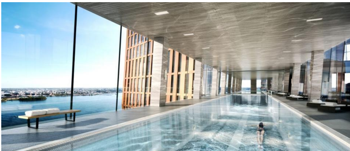
Skybridge lap pool