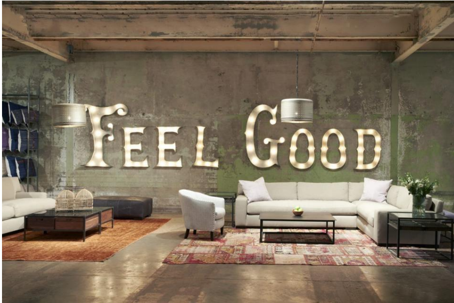
Cisco Home High Point showroom

It's not a resort or residence, but Cisco Home's showroom flashes classic California style in a way that just (ahem) feels good. Is it the illuminated flower child font, cozy sustainable furniture or photographic genius? No matter—this joint is ideal for casual lounging or loitering (oh, and shopping) based on good vibrations alone.