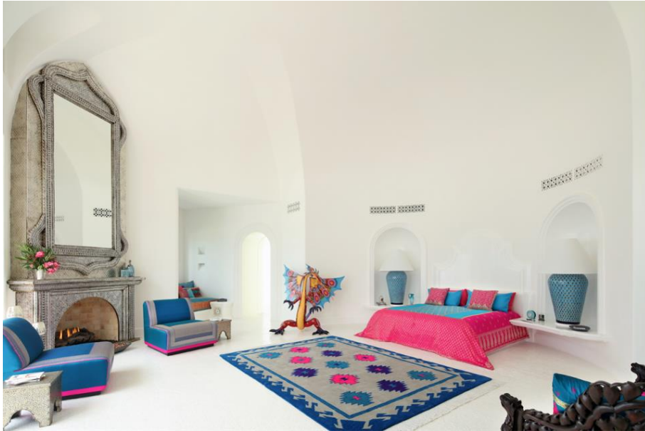
Vibrant bedroom at Ty Warner Mansion

Again, Ty Warner Mansion's remarkable features deserve to be freeze framed and marveled at in perpetuity. This vibrant bedroom against an all-white backdrop bursts with so much candy-colored flavor one can almost taste it. And check out that magnificently massive fireplace mirror and graphic dragon.