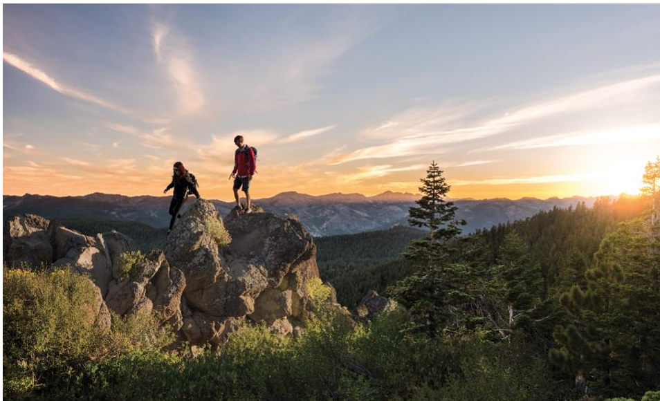
Superior mountaineering trails