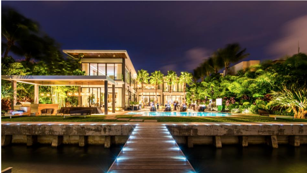
Kobi Karp-designed private paradise

This lush bayfront estate from Kobi Karp Architecture & Interior Design is an entertainment paradise with linear wood-clad layouts, floor-to-ceiling windows, a luminescent pool, privacy gardens with native trees, large decks, a boat dock, and envious city vistas.