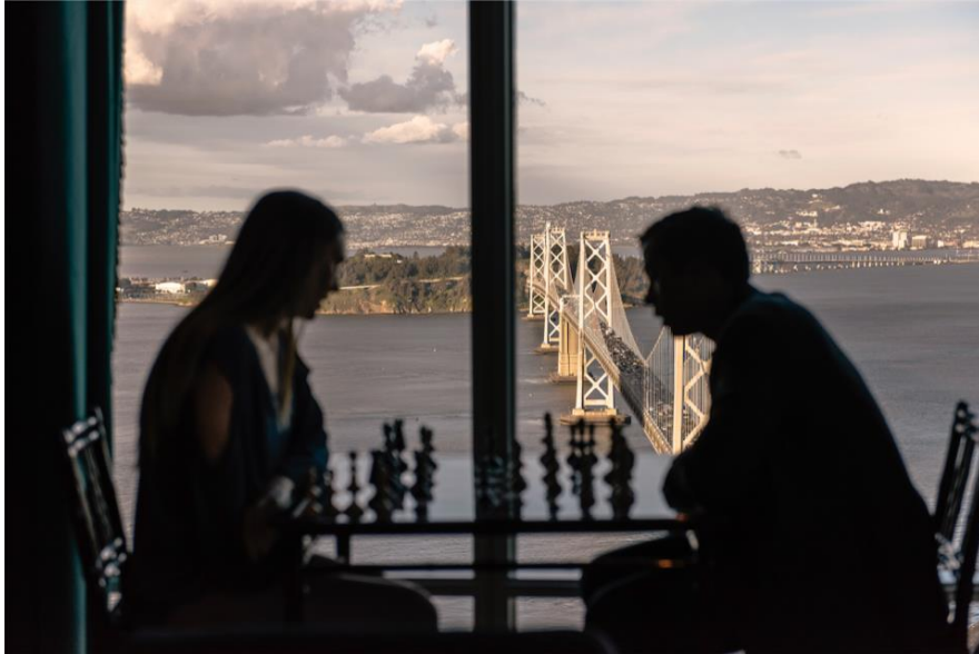
A chess match amid a scenic bridge backdrop.

The Harrison is a new bayside condominium that features interiors by Ken Fulk and a rooftop lounge called Uncle Harry's, which offers dramatic views of the San Francisco-Oakland Bay Bridge.